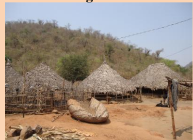
Lady sitting outside