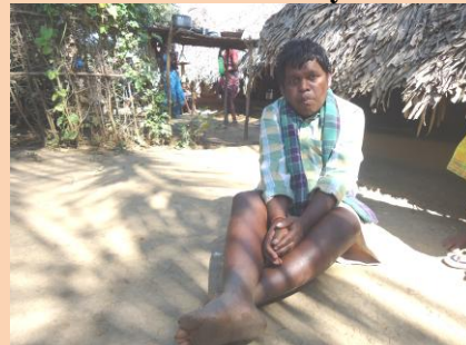
A disabled boy