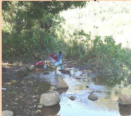
Witnessing in tribal village