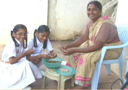
Church tithes and offerings (Rice)