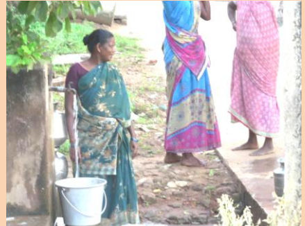
People in the street