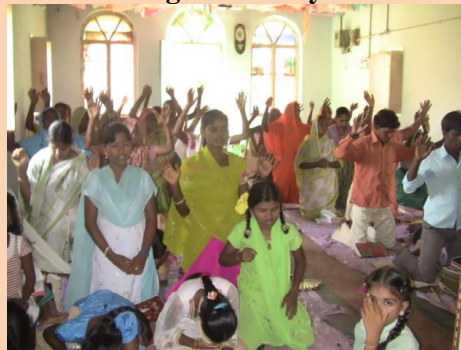
Preaching at Bethany Church