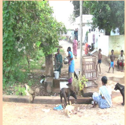
People in the street