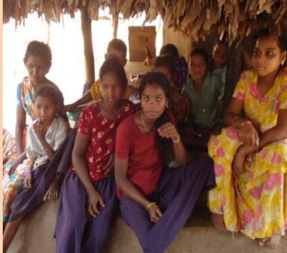
Preaching the gospel