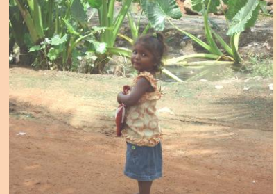
Children attending school